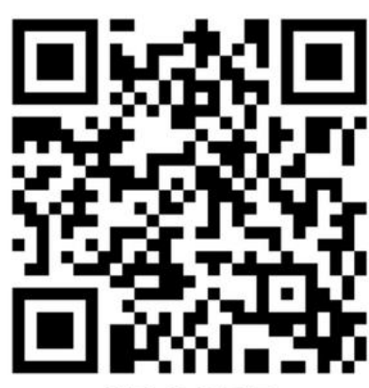
OR CODE (for learners)

Our two full-time psychologists offer safe and confidential spaces to support the emotional well-being of all learners at Rhenish.